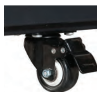
Optional Castors (comes in a 4 set)

CBN-9RU-64WM, CBN12RU-64WM and CBN-15RU-64WM can be installed as Free Standing Cabinets when used with a set of Serveredge Lockable Castor Wheels - CASW04 (To be Purchased Separately)