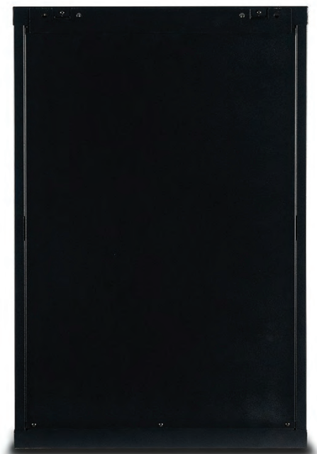
Removable Back for Easy Access