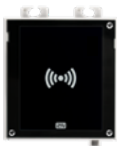
2N® ACCESS UNIT 2.0 RFID ord. 9160334 9160334-S (secured)