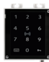
2N® ACCESS UNIT 2.0 TOUCH KEYPAD & RFID ord. 9160336 9160336-S (secured)