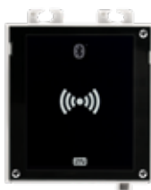
2N® ACCESS UNIT 2.0 BLUETOOTH & RFID ord. 9160335 9160335-S (secured)