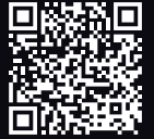
TRB500 360° VIEW