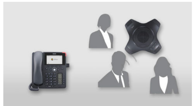
Now you can use the connected wireless speaker at up to 25 m distance