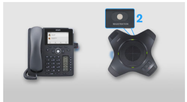
Establish a DECT link to the wireless speaker