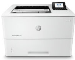
HP LaserJet Enterprise M507n

Choose an HP LaserJet Enterprise printer designed to handle business solutions securely and efficiently, and helps conserve energy with HP EcoSmart black toner. Keep up with the demands of growing business with a printer you can rely on.