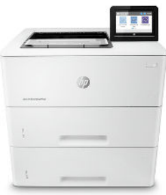
HP LaserJet Enterprise M507x