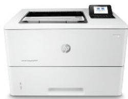
HP LaserJet Enterprise M507dn