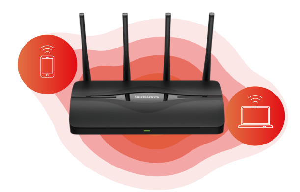
MR27BE with Beamforming

4× omni directional antennas, proprietary Wi-Fi optimization, and Beamforming technology deliver broader coverage, more capacity, stronger and more reliable connections, and less interference.