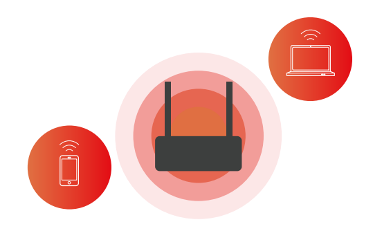
Regular Router without Beamforming