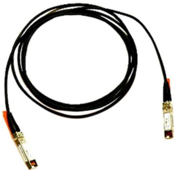
Figure 3. Cisco direct-attach twinax copper cable assembly with SFP+ connectors

Cisco SFP+ Copper Twinax (Figure 3) direct-attach cables are suitable for very short distances and offer a cost-effective way to connect within racks and across adjacent racks. Cisco offers passive Twinax cables in lengths of 1, 1.5, 2, 2.5, 3 and 5 meters, and active Twinax cables in lengths of 7 and 10 meters.