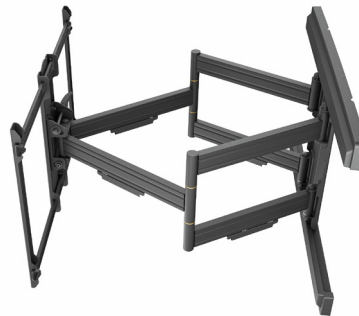
Heavy-Duty Full Motion Mount AD-WM-7060

Recommended for heavier displays and longer arm