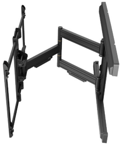
Full Motion Mount AD-WM-5060

Suits most full motion single display applications